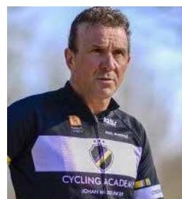
Johan-Museeuw Road World Champion, 3 x Paris-Roubaix Champion, 3 x Tour of Flanders Champion