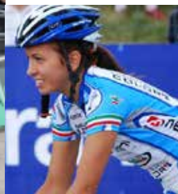
Giada Borgato Italian National Road Champion