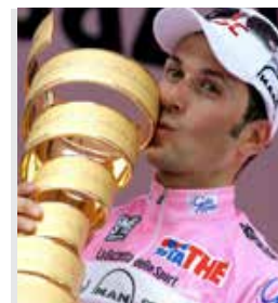
Ivan Basso 2 x Giro d'Italia Pink Jersey, Tour de France White Jersey