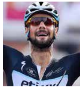
Tom Boonen Tour de France Green Jersey, 3 x Tour of Flanders Champion, 4 x Paris-Roubaix Champion, Road World Champion