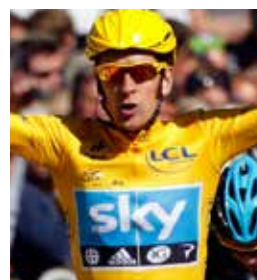
Sir Bradley Wiggins Tour de France Yellow Jersey, 5 x Olympic Champion, TT World Champion