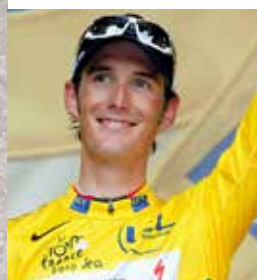
Andy Schleck Tour de France Yellow Jersey, Liege-Bastogne-Liege Champion