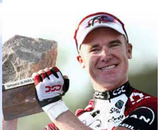
Stuart O'Grady Olympic Gold Medalsist, Paris-Roubaix Champion, 17 x Tour de France rider, Track World Champion