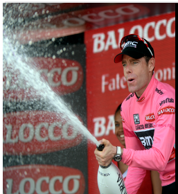
Cadel Evans 2011 Tour de France victor, four time Olympian, Road World Cycling champion