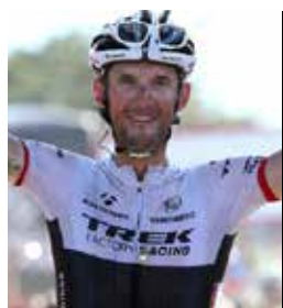
Frank Schleck 5 x National Road Champion, Amstel Gold Champion